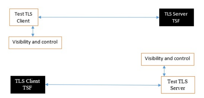
Figure 2: Test environment for TLS 1.3 using custom endpoint capabilities for visibility and control

TLS 1.3 introduces the encryption of handshake messages subsequent to the server hello exchange which prevents visibility and control using midpoint capabilities. To achieve equivalent validation of TLS 1.3 requires the ability to modify the traffic underlying the encryption applied after the server hello message. This can be achieved by introducing additional control of the messages sent, and visibility of messages received by the test TLS client, (when validating TLS server functionality) or the test server (when validating TLS client functionality).